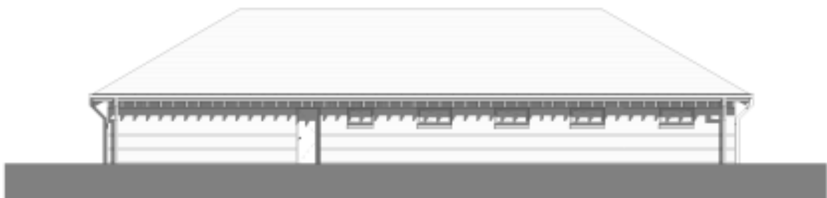
Existing South Elevation